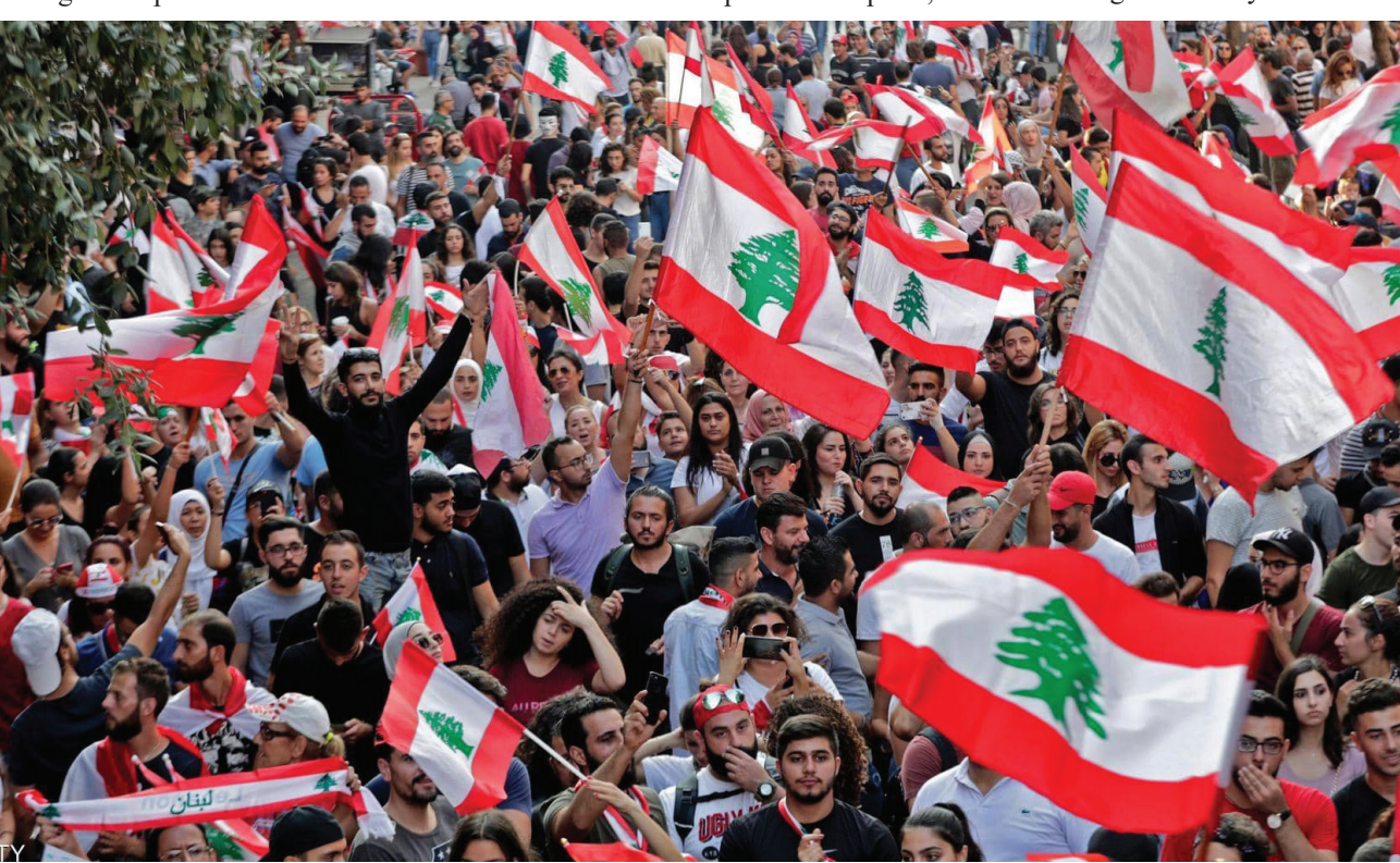
Life in Lebanon remains disrupted by the closure of the streets.

"The Lebanese people 2 have given us many? chances and expected reform and job opportunities," said Hariri.