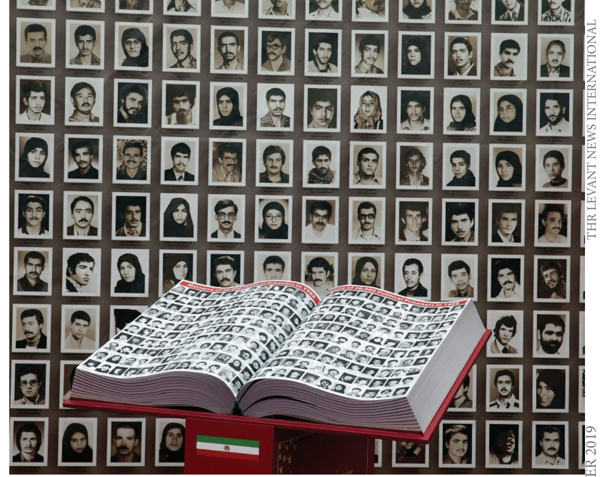
"Conspirators should be hanged in Friday prayers for people to see them and to have more of an impact," Rouhani told a Parliament session on July 13, 1980.

The National Council of Resistance of Iran (NCRI) is committed to the Universal Declaration of Human Rights and international instruments and conventions including the International Covenant on Civil and Political Rights, the Convention against Torture and the Convention on the Elimination of All Forms of Discrimination against Women.