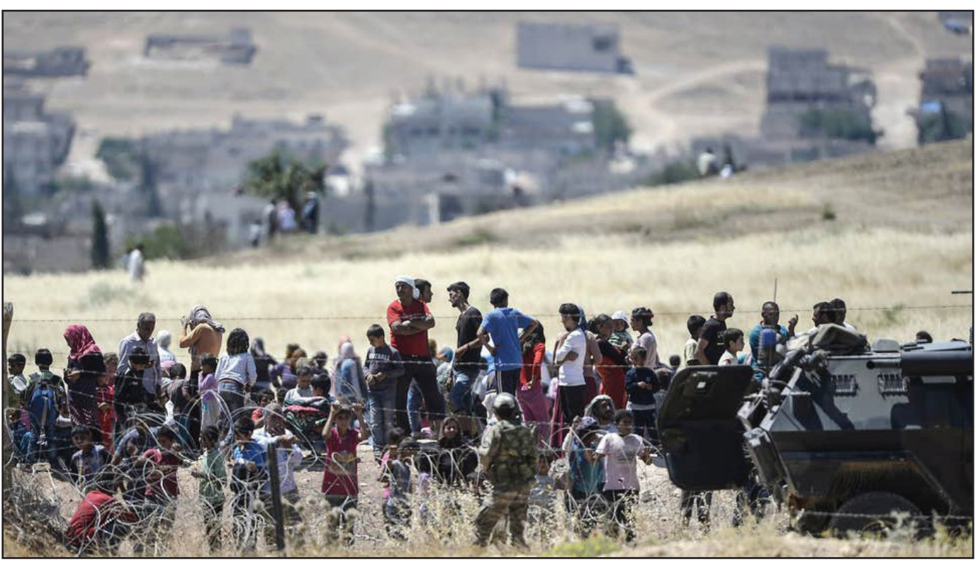
Turkish guards watch over Syrian refugees at the border