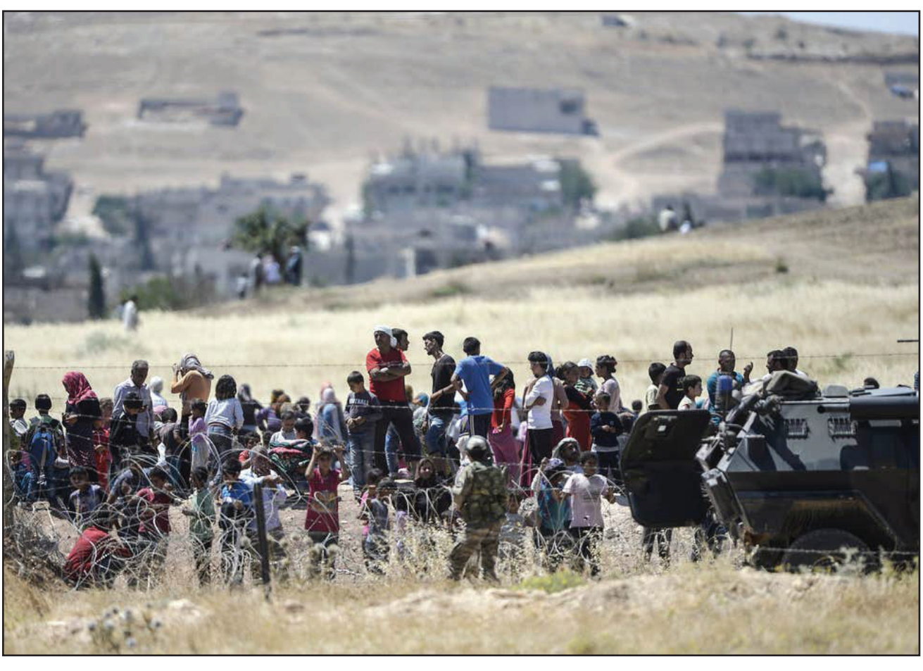
Turkish guards watch over Syrian refugees at the border

Gendarmes tortured and brutally beaten eight Syrian citizens for hours. Seven border guards took turns humiliating and beating them as they attempted to cross into Turkish territory near