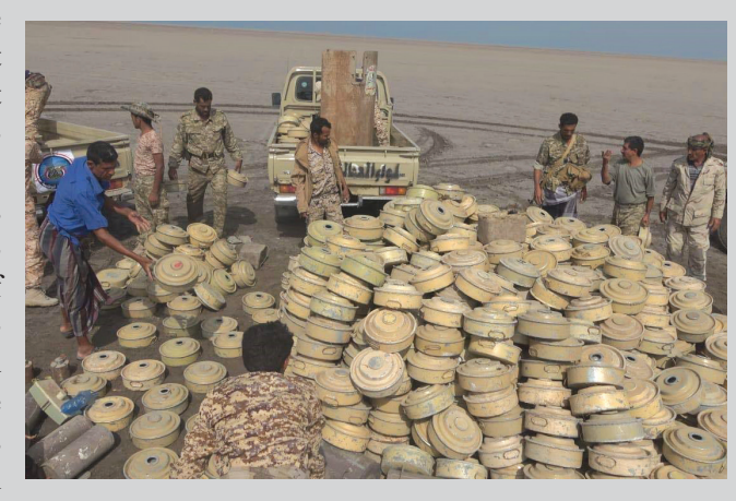
Pro-government forces removed 300,000 landmines laid by the Houthis between 2016 and 2018

He added: "The security forces managed to seize a number of cells sent by the Houthi militias to plant mines and IEDs in popular markets and ci-