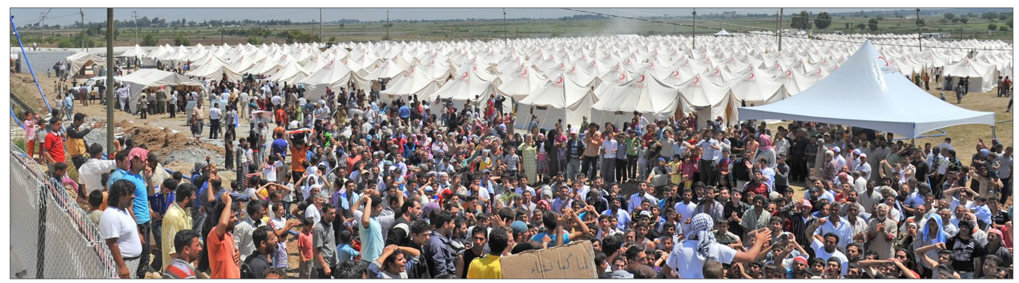
One of the refugee camps by the Syrian Turkish Border

In addition to prolonging detention periods for Syrians without being brought to the Lebanese judiciary. The arrests were made on charges such as lack of work permits, or failure to renew residence papers. The arrest often resulted in the forcible transfer of numbers of Svrians to Svria and their handover to the security forces.