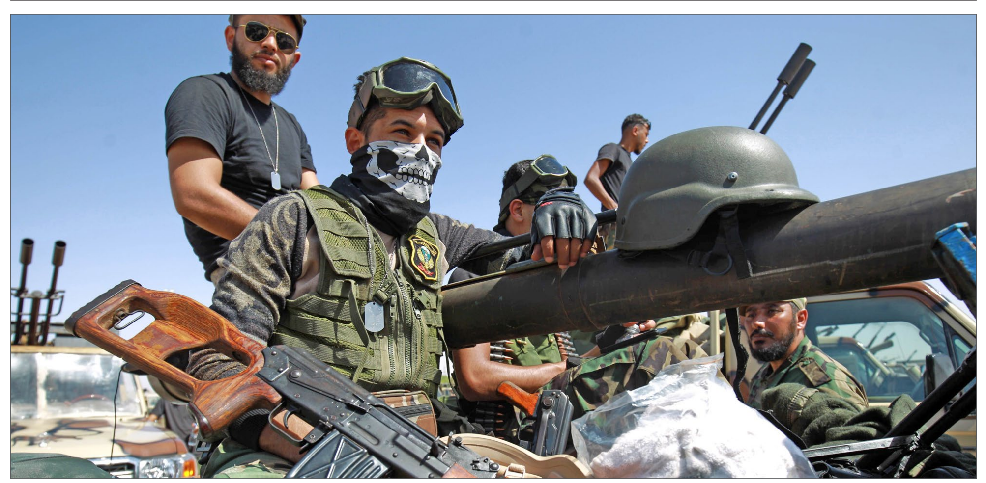
(LNA) special forces gather in the city of Benghazi