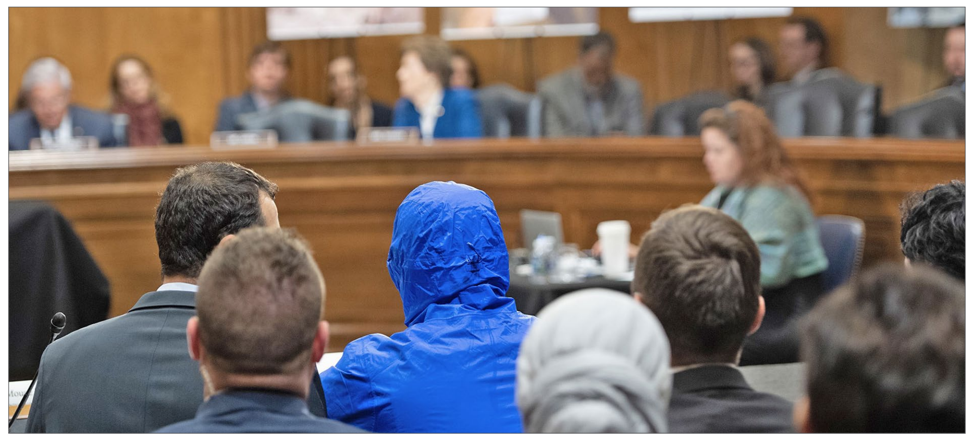
"Ceaser" testifying about the war in Syria during a Senate Foreign Relations committee hearing on Capitol Hill

If the sanctions can avoid harming normal Syrians whilst deterring third party allies from investing the Regime's war machine then it seems hard to argue with them, but it is a big "if" that could rapidly spiral into further hardships for Syrians. Interestingly the Caesar sanctions highlight how far we've come from that narrative of the Regime being secure and now looking to reap the benefits of reconstruction. Instead their vulnerability and reliance on external support, that could now be choked, has been exposed something that may have been on the minds of the protestors that took to the streets in the city of Suweida. The coming months will reveal the true cost of the sanctions to the Syria elite, its people and its allies all against the backdrop of an impending Coronavirus outbreak.