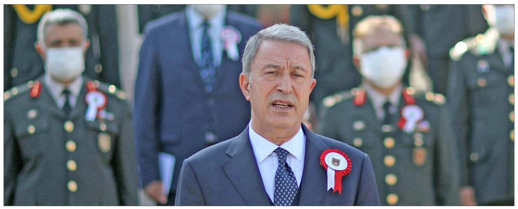
Minister of Defense Hulusi Akar