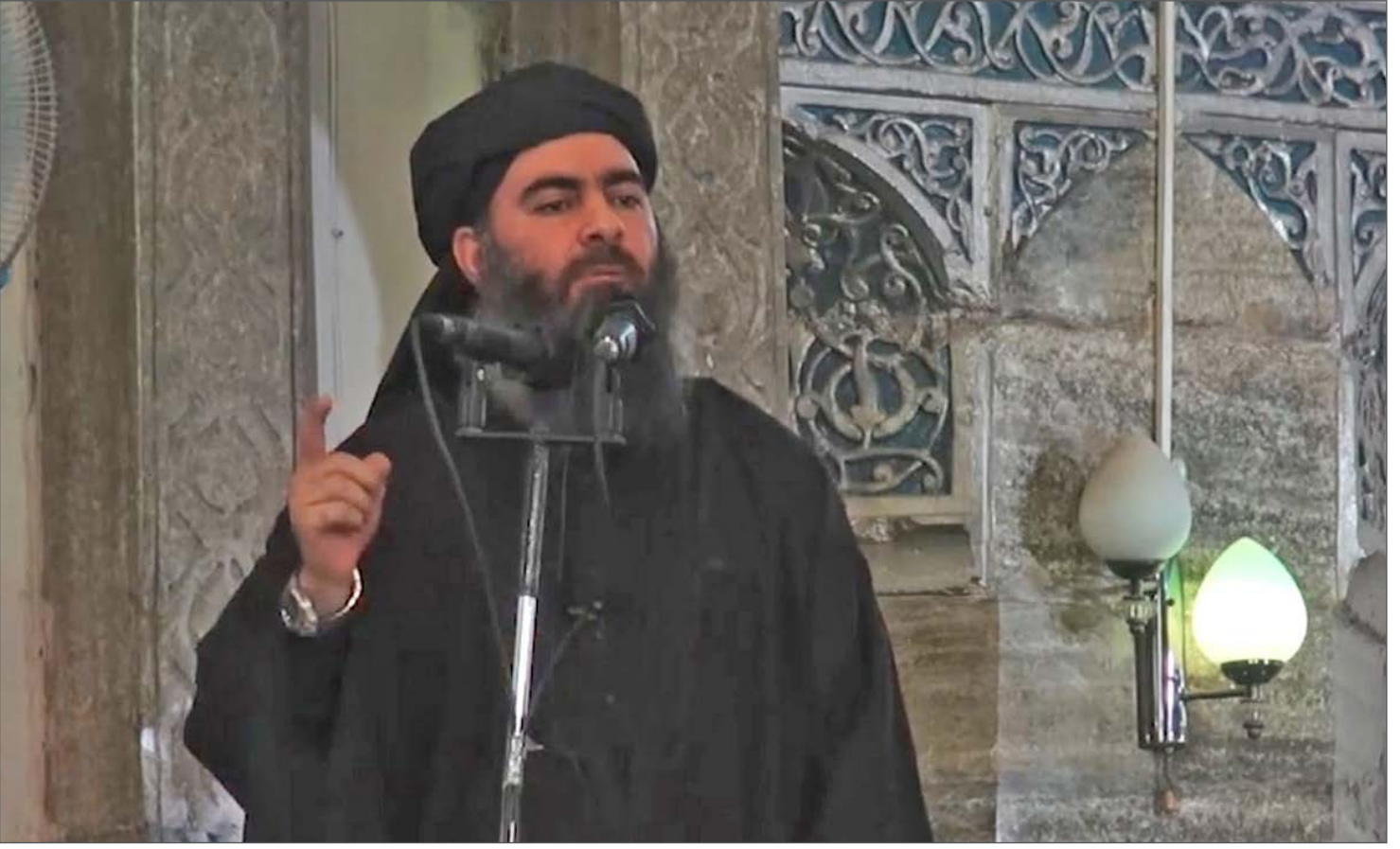
Abu Bakr al-Baghdadi