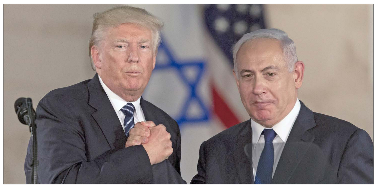
Donald Tump (Right) and Benjamin Netanyahu (Left)

An additional factor is Israel's newlyformalized relations with the UAE and Bahrain in the Abraham Accords, brokered by Trump and signed last September in the White House. Saudi Arabia is another important actor though for reasons of its own it is unlikely to follow suit, at least for