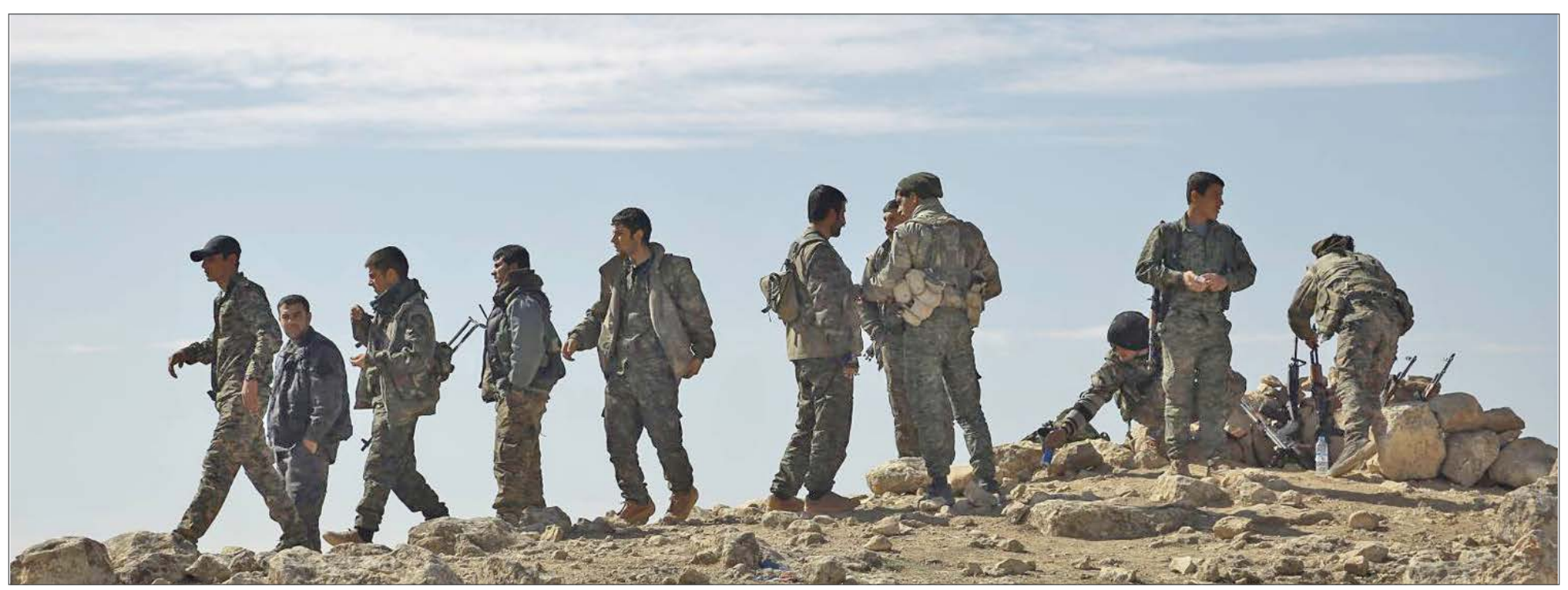
Fighters from the Syrian Democratic Forces