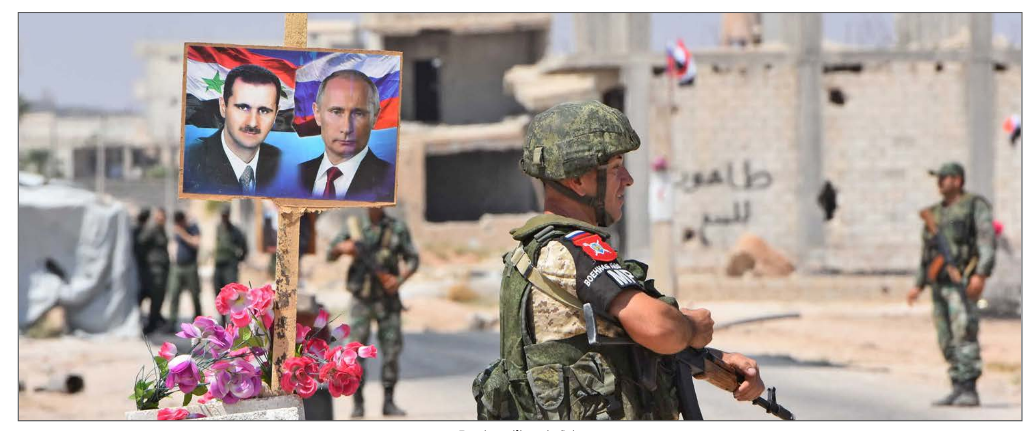
Russian military in Syia