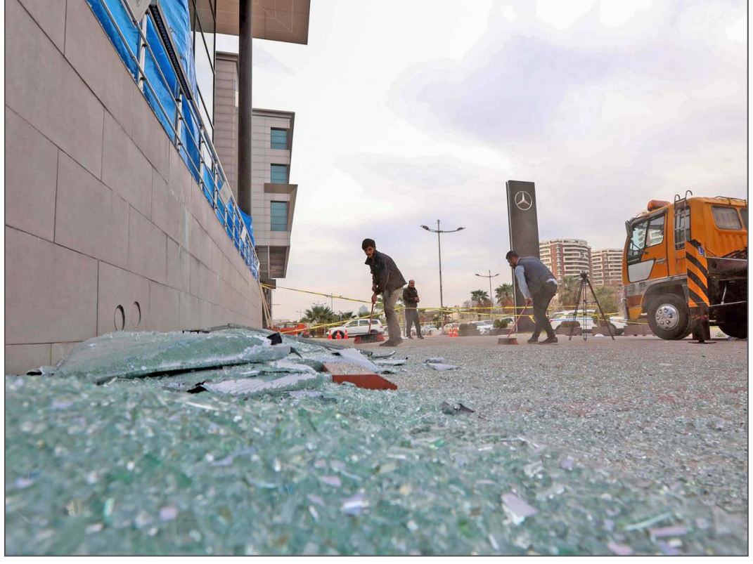
From the aftermath of the attack in Erbil

The international and Arab outcry made the Iranian-backed militias> efforts to threaten Kurdistan>s people and authorities backfire on them. The attacks may push the Global Coalition to increase its forces to protect the safest place in Iraq, which the Tehran backed militias are aiming to tarnish with terror and blood, as they had done in other in the rest of Iraq. The attack might also change the way the American administration deals with Iran.