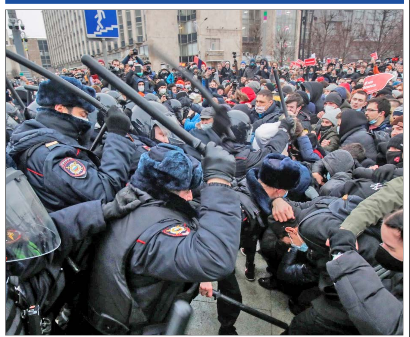
Demonstrations in Moscow

The Russian Minister of Foreign Affairs Sergey Lavrov stated that European diplomats who joined the illegal demonstrations their Russia knew that participation contradicts the Convention which Vienna gives privileges and immunities