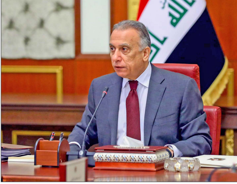
Iraqi PM Mustafa al-Kadhimi

Observers see these snap elections as a result of a political conflict between the parliament and the government, and that they have nothing to do with people's demands. They believe that they are merely cards that the political alliances and parties play. This might be evident in the call of the Speaker of the Council of Representatives of Iraq, Al-Halbousi, for earlier elections aimed at preempting what was leaked about Al-Kadhimi's request from President Barham Saleh to dissolve the Parliament. Snap elections might save Iraq if they were held under normal circumstances under judicial supervision, a new constitution and free from quotas and confessionalism giving Iraqis the freedom of choice. However, if nothing changed there would be no point in changing the political figures and Iraq will continue to struggle on the long run in terms of national security, economy and political situation which might lead to dividing the country in the future. With the snap elections date approaching, the tension between political Islam groups and civil movements have climaxed the Islamist sensing the threat of