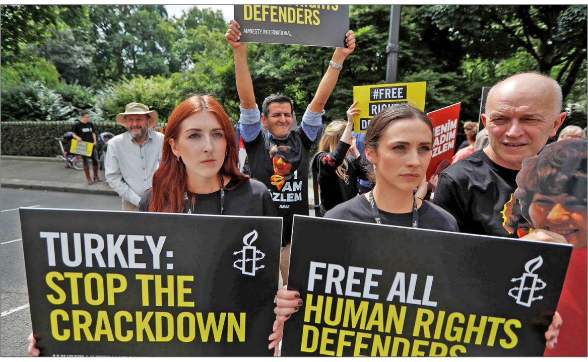
Demonstrators protest outside Turkey's embassy in London